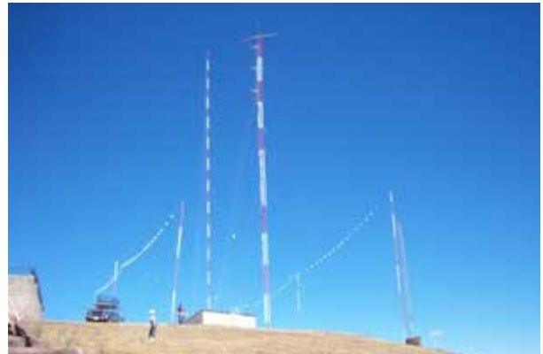
The antenna farm