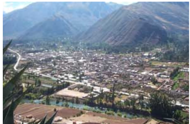
Urubamba by Day

Field Address: Apartado 368 Cusco, Perú 011-51-84-270508 (international from the US) (937) 919-5231 (domestic from the US) brucendebbie87@gmail.com