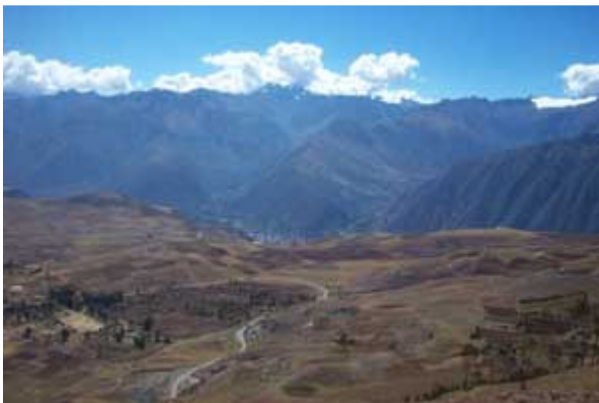
A view of the Urubamba from atop Cerro Sacro where the antennas and the transmitters are.