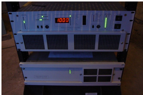
The Transmitter of Radio Chaski: