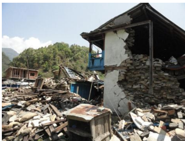
Damaged building in Gorkha District, near epicentre of earthquake