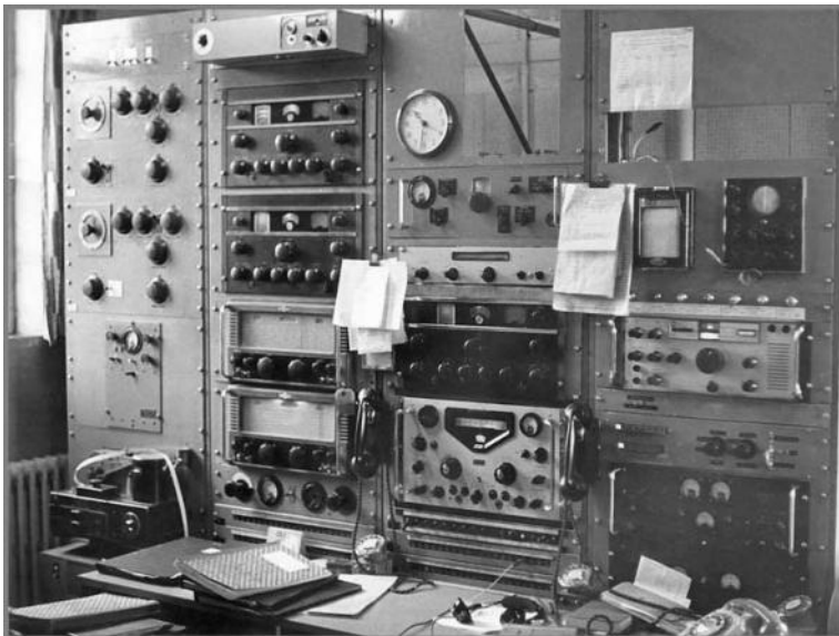
SME duty position (Operational Supervisory equipment), with RCA AR-88D, AR-88LF, Eddystone 770R & 770U, Racal RA-17, GEC BRT-400 etc

A.E.i.C and Clerical Staff offices - the roof collapsed some years ago following heavy snow