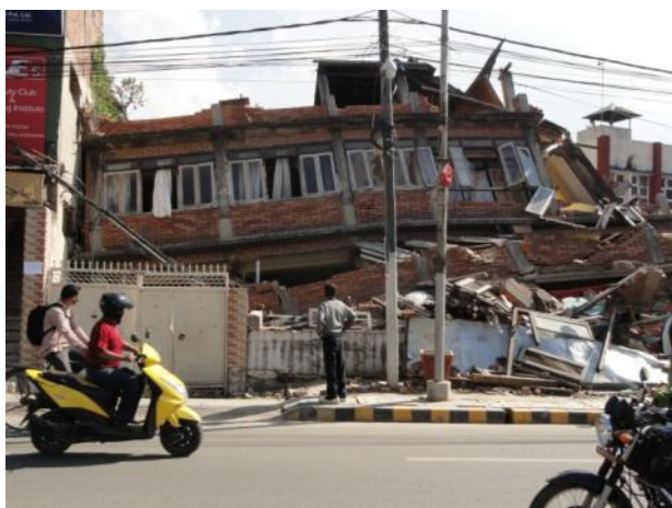
A damaged building in the heart of Kathmandu