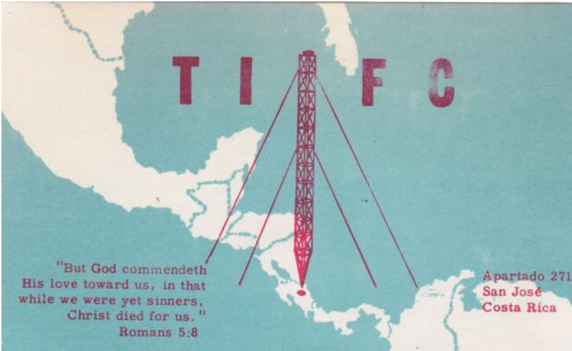
Faro del Caribe 6037 kHz from 1958