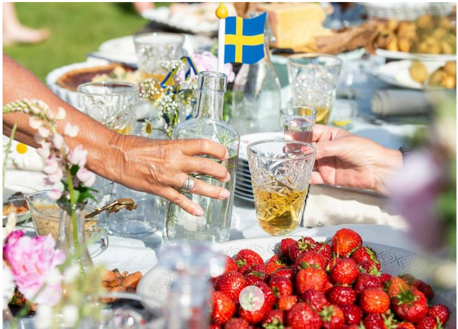
Salmon, snaps and strawberries – how to do Midsummer like a Swede