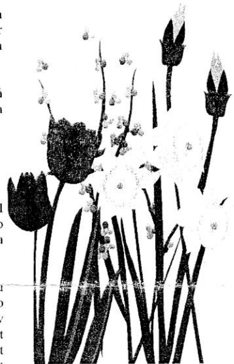
Denna bild fyller ut ett tomrum på sidan

Essential for a "desk top reporter" is a pen-pal or a good DX bulletin where programme content is described in some detail. In olden days, in the early 50's, the WRTH was an excellent source for programme detail. Thresholds were low, so "At 0200 GMT News in English" would sometimes produce a QSL-card from countries such as British Honduras (present-day Belize), or Trinidad & Tobago. This I know from people who actually managed to do the trick.