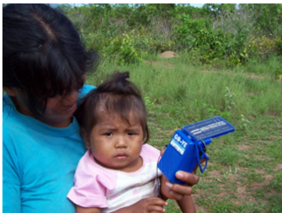
both her baby and a pretuned, short wave receiver.