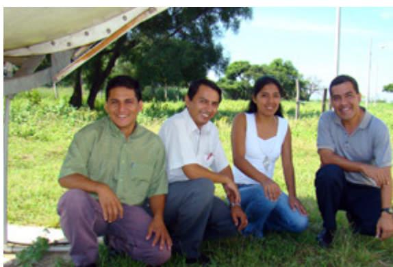
ve broadcasting staff