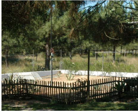
Wooden post with another grey box; that's the SW coast Beverages selector. I know, some do not advise to use the same transformer for more than one Beverage!