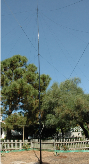
SW coast K9AY uses a rod + a number of radials