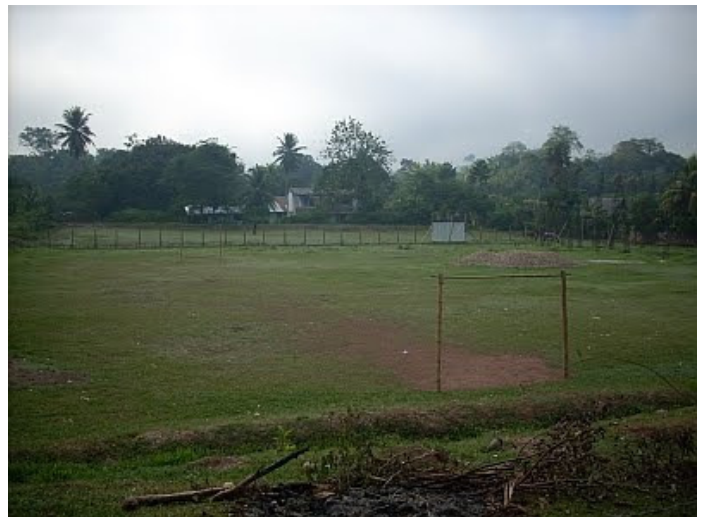
En este terreno en Chazuta se construirá la Radioemisora