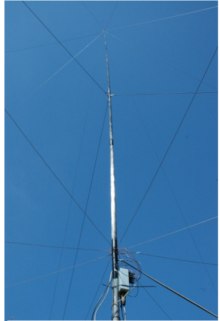
Lisboa K9AY has a natural ground, i.e. two copper rods