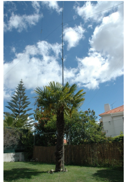
One 12 m Spieth mast is holding SW coast K9AY, the other is here in Lisboa, where it's holding a LF/MF low noise Vertical. Also an EWE in 145° is used here.