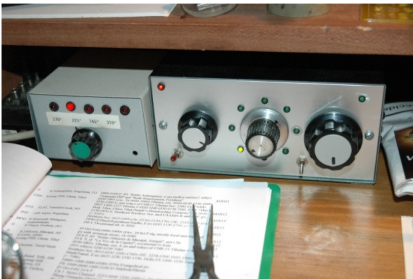
Beverage selector to the left and the K9AY control unit. The unmarked LED on the Bev. box is for a short wire, beamed 180°, but since all Bevs. are unterminated, the displayed azimuths mean the back lobes are also valid.

The K9AY controller has 2 RTerm adjusters, the knob on the left is the coarse adjustment, the one on the right is for fine adjustment selected via the switch beneath it, and this is achieved with a 10 turn potentiometer.