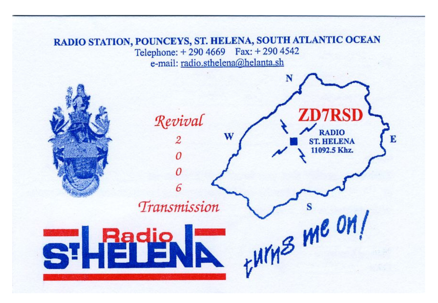
The QSL I have is from Oct 6\,1990 and looks more or less the same. A very special QSL for me. This one is from the revival transmission in 2006. /TN