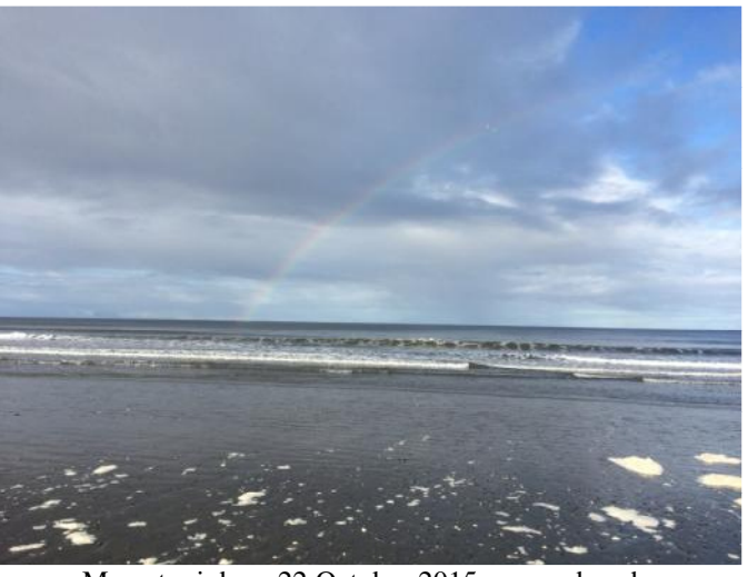
Masset rainbow 22 October 2015, on our beach.

1. NW BOG (Beverage on ground). 700' or so in length. Unterminated. This is always my go-to antenna with excellent results. It's the first antenna up, and the last to be removed. DX RPA1 amp added at the antenna lead in, as well as chokes on both ends of the coax.