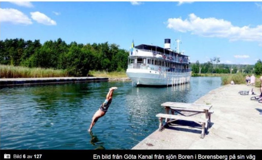
Sjöbilden tog jag i tisdags då jag var ute och körde amatörradio i naturen. Båten på kanalen är nog ca 3 år. Den kom också med.