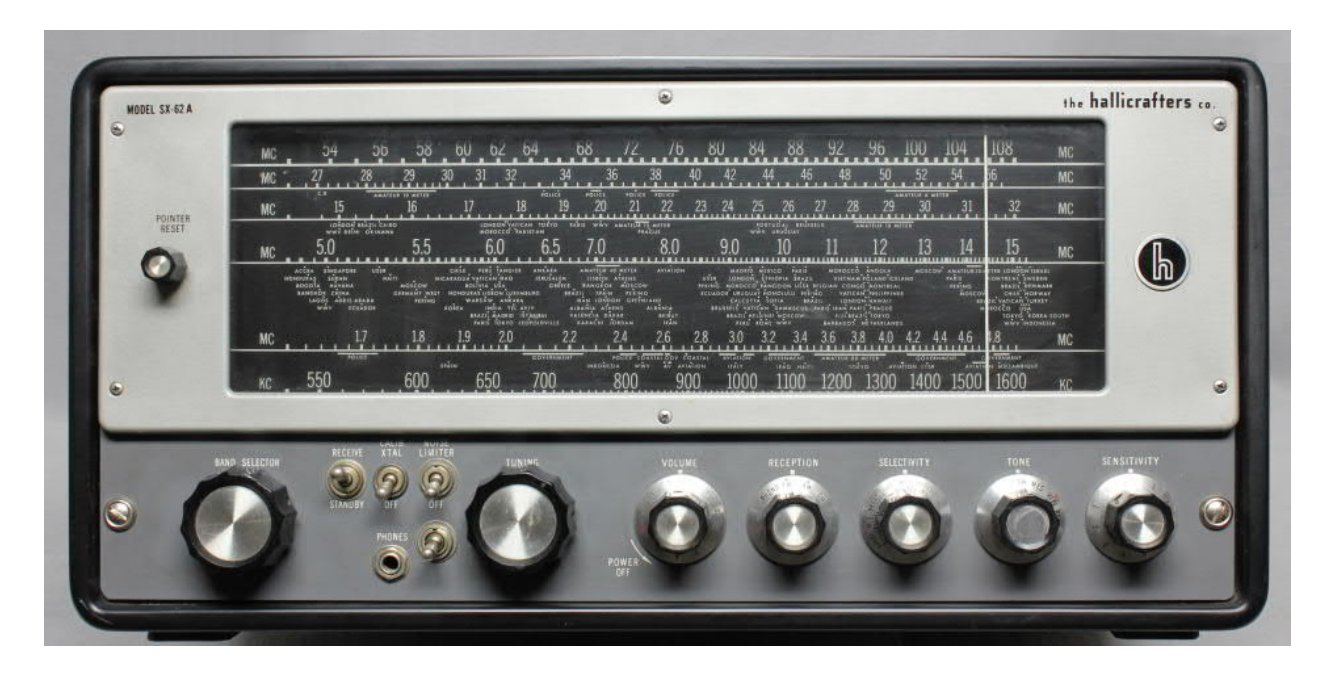
The SX-62 is a single conversion general coverage receiver for AM, CW and FM. It fully covers 540 KHz to 110MHz in six bands. Introduced in 1948, it has 15 tubes. It was primarily intended for the serious shortwave listener who also wanted FM and excellent sound.

The IF section is automatically switched using 455 KHz for the lower four bands and 10.7 MHz for the upper two bands. It is erroneously listed as a double conversion receiver in several references. Only one converter is used in turn for each of two IF frequencies, one for AM broadcast and most shortwave and the other for the upper two bands primarily for VHF and FM. Using a pair of 6V6 for 8 watts of push-pull audio output, the set is designed for high fidelity when listening to FM but offers six bandwidth selections for various communication needs.