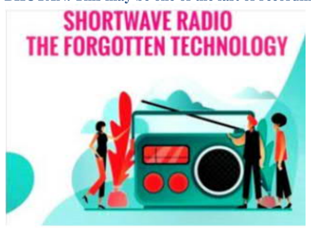
BHUTAN. This may be one of the last of recording of BBS on shortwave

Go to: <a href="https://www.youtube.com/watch?v=M0-0TmLEnYQ">https://www.youtube.com/watch?v=M0-0TmLEnYQ</a>